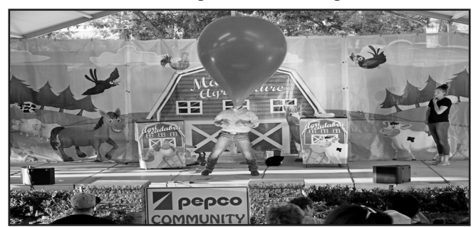
Fun and Entertaining Daily Shows!

PRESENTS HEALTHY EATING OF AG Educational Agricultrual Magic Show