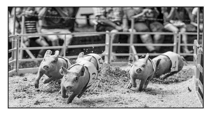
Races are scheduled various times daily! Come join the FUN!