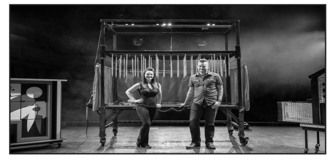
Get your seat early & prepare to be amazed!

Shows are scheduled at various times daily!